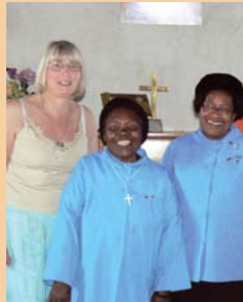
St. Barnabas Mothers