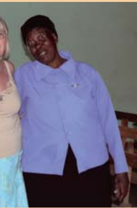
Members from Mothers' Union, Smithfield