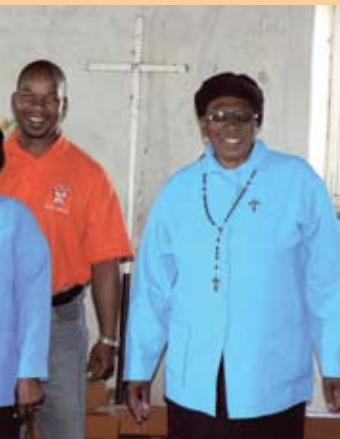
Members' Union, Bethulie