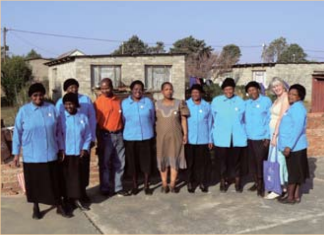
St. Athanasius Mothers' Union, Zastron. The members are standing inside the new church building. The red walls show the progress of the building work.